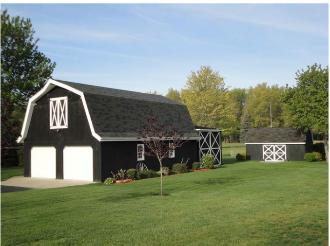
2007: A 24'wide x 16'deep x 11' high addition was added on the back of the barn. An entrance door (30"wide) was added as an access from the existing barn to the new addition. 2 large roller-type doors were added to the back and side. A large hinged double-door was added to the north side of the addition (10' high X 15'wide). This can be used as an entrance for storage of large a vehicle, boat etc. All doors are cross-buck